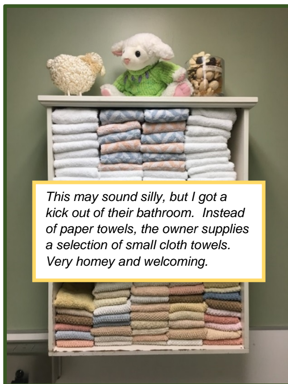
This may sound silly, but I got a kick out of their bathroom. Instead of paper towels, the owner supplies a selection of small cloth towels. Very homey and welcoming.